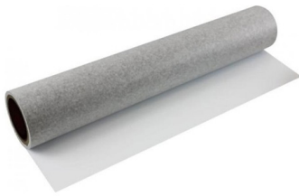
Matt white wallpaper