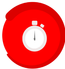
Easy to install